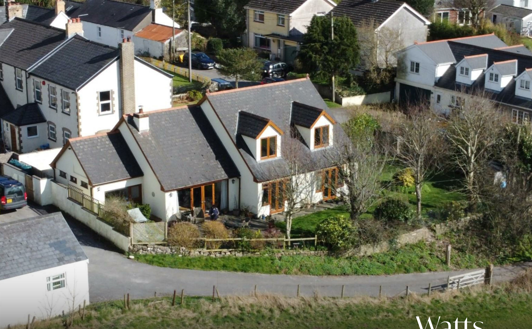
The Meynell, Trerhyngyll, Vale Of Glamorgan, CF71 7TN